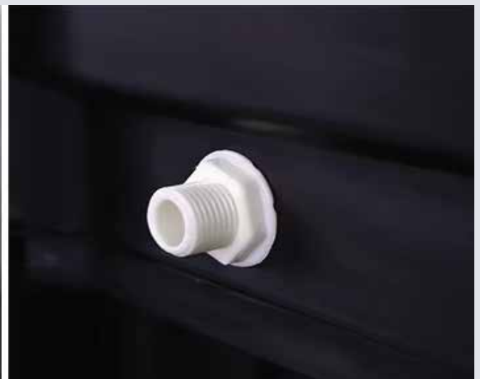
water inlet valve