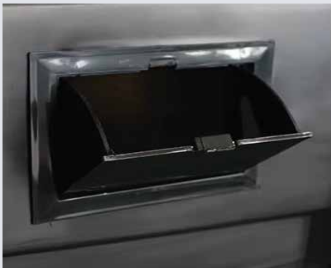
Manual water inlet