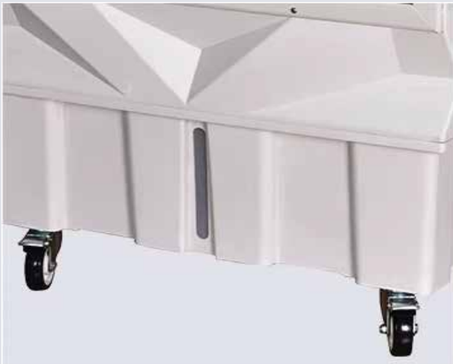
Water level indicator