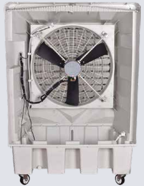
Polypropylene Fan Blades